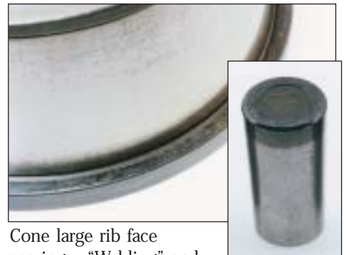
Cone large rib face scoring – “Welding” and heat damage from metal-to-metal contact.

* Excessive preload can cause damage similar to inadequate lubrication damage.