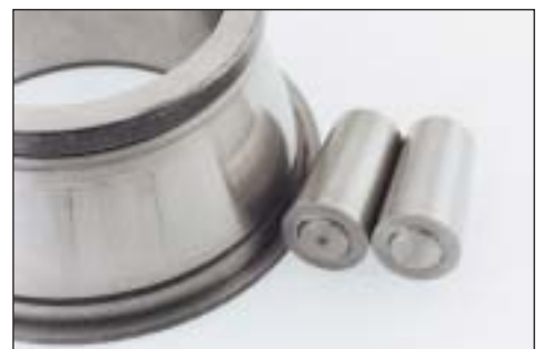
Abrasive wear – Fine abrasive particle contamination.