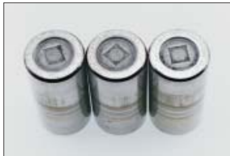
Roller end scoring – Metal-to-metal contact from breakdown of lubricant film.