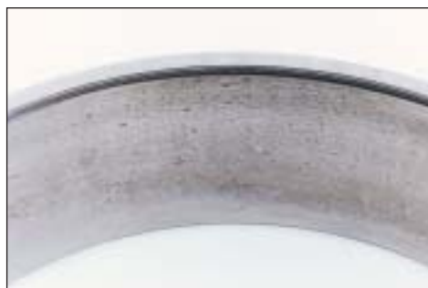
Bruising – Debris from other fatigued parts, inadequate sealing, or poor maintenance.